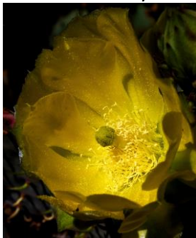
Macro shot of prickly pear blossom.

It looks like we won't have a May meeting as we'll still be under Governor Ducey's stay-at-home orders. To plan for, and look ahead to June, let's get creative with some themed shooting. In the panel normally housing the Tips and Tricks, you'll find a list of topics. Be literal, or stretch the topic. Shoot one or shoot them all. Bring your images to the June meeting and be prepared to share the stories behind your topic images.