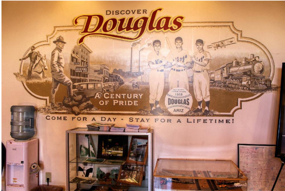
The Letter D