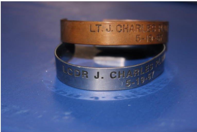
Lit by Artificial Light