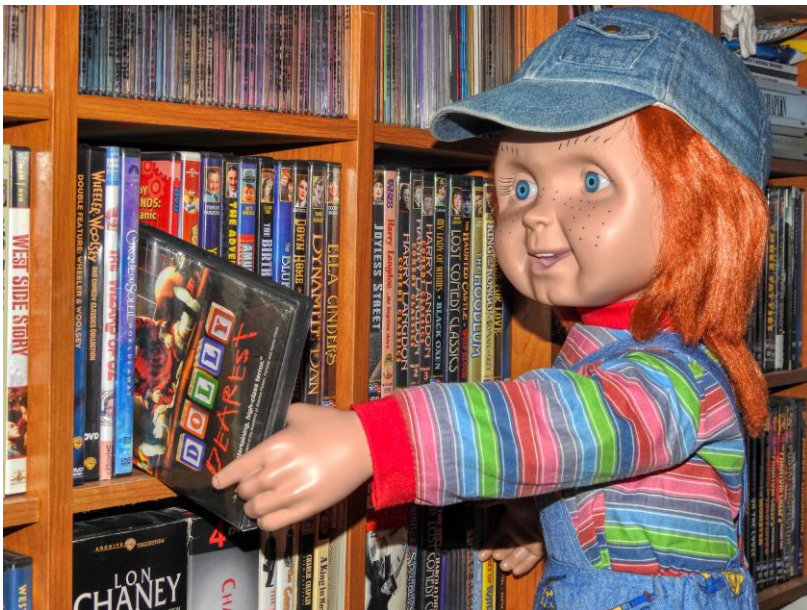
Doll d ecides on D olly D earest DVD