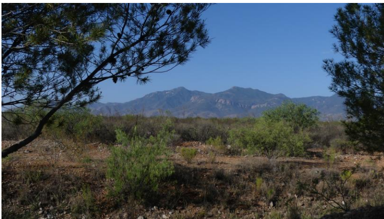
Lit by Natural Light