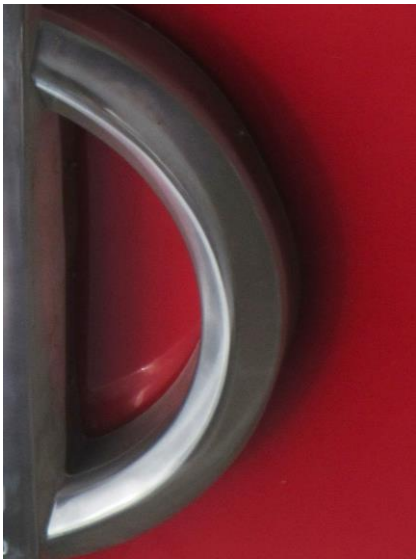
The Letter D