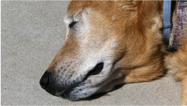
Blinded by the Light