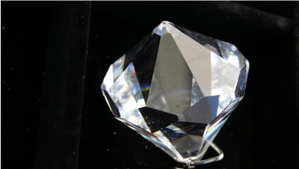
The Letter C