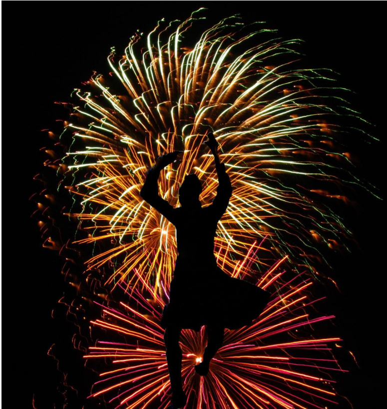
Dancing in the Dark