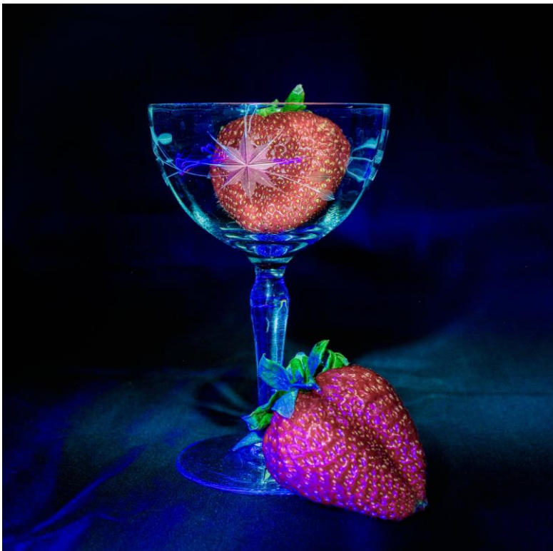
Lit by Artificial Light