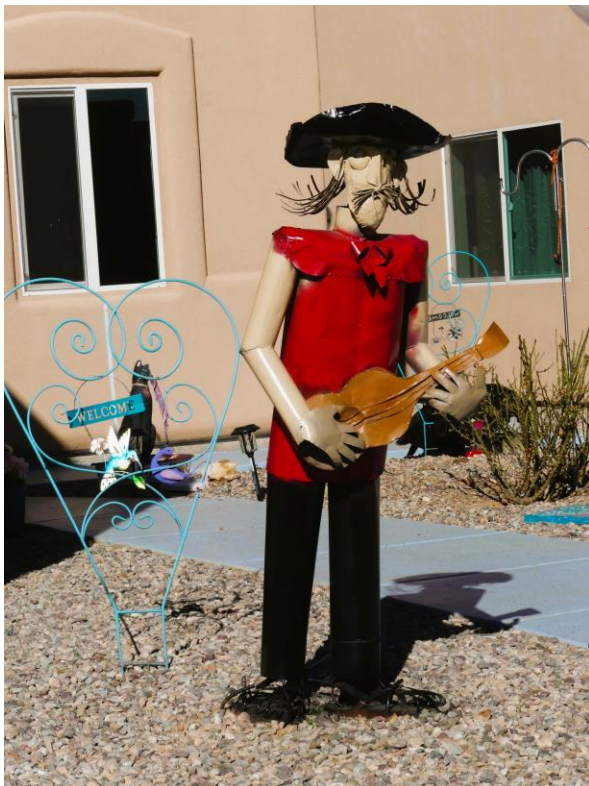
May Favorite Color: Red