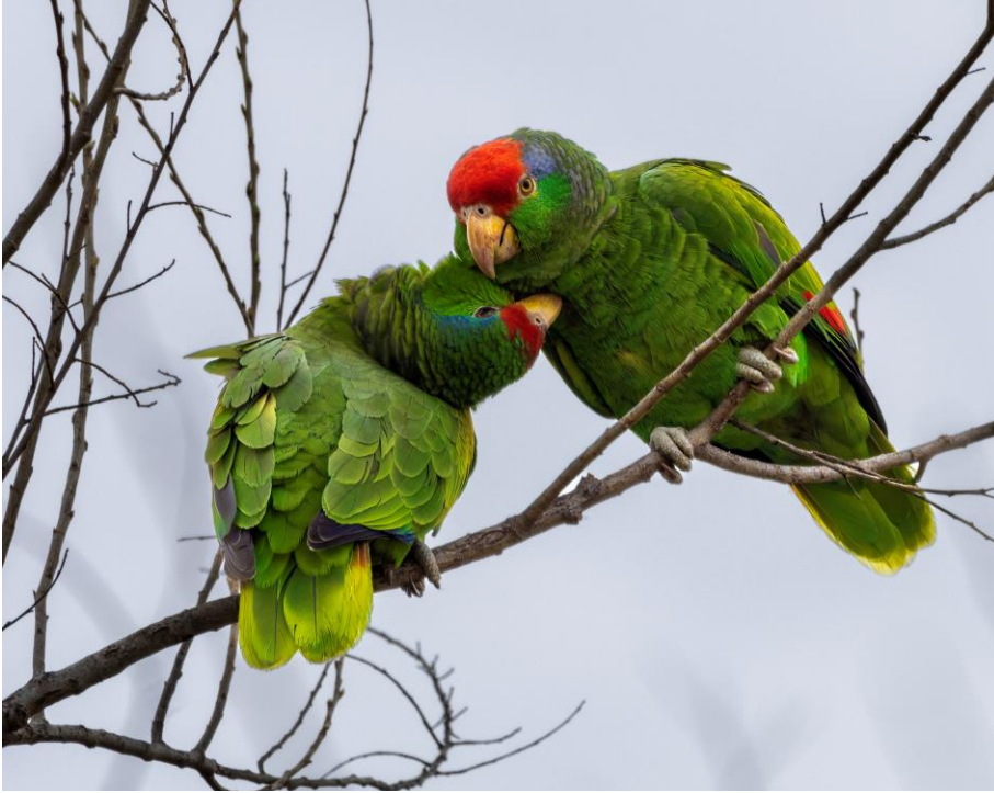
Let's Stay Together