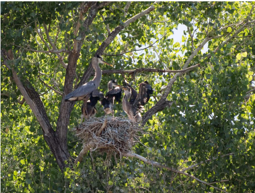
Herons on Nest