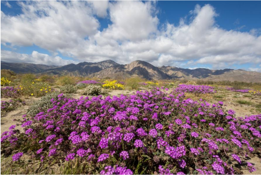
My Favorite Color: Purple