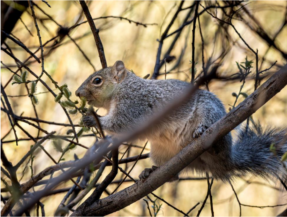
Arizona Gray Squirrel Munching on Willow Blossoms