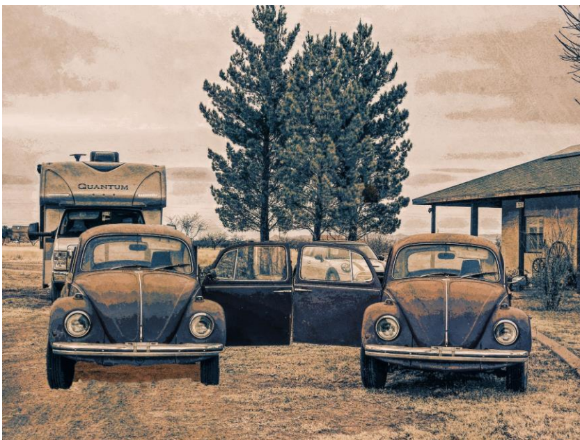
Let's Stay Together