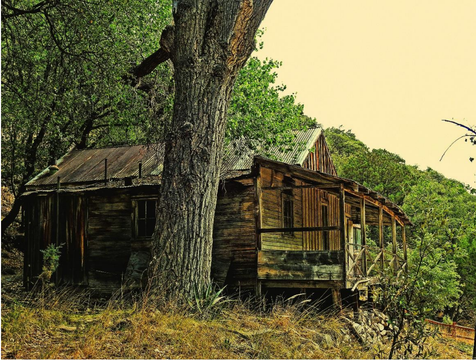
My Favorite Color: Local Color