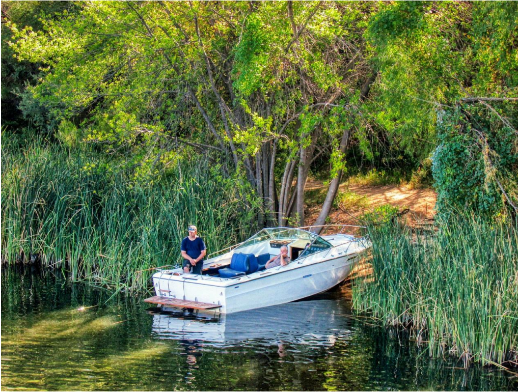
Here: We're Here; Now What?