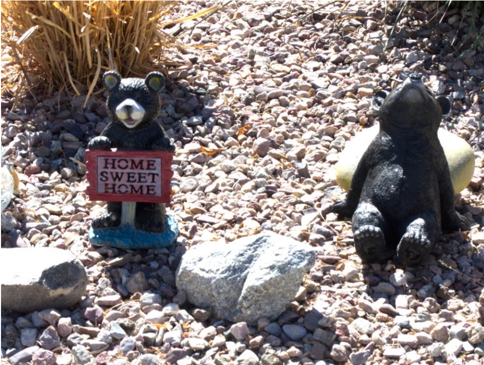
Let's Stay Together