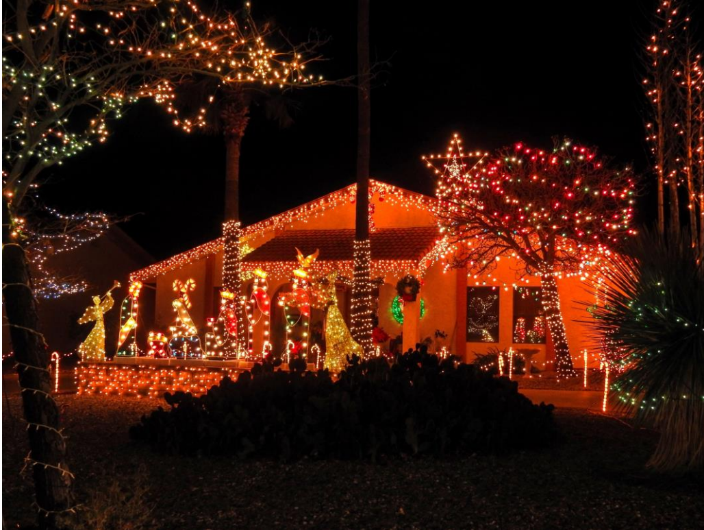
December Challenge Word: Holiday