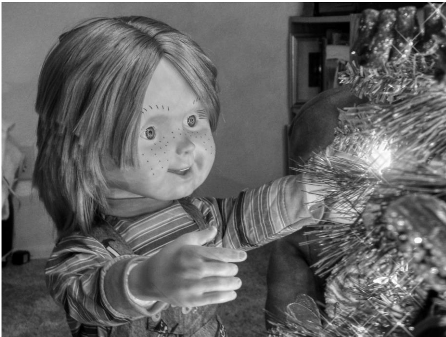
December Challenge word: Holiday Magic