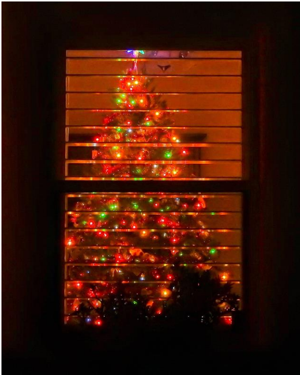
December Challenge word: Holiday