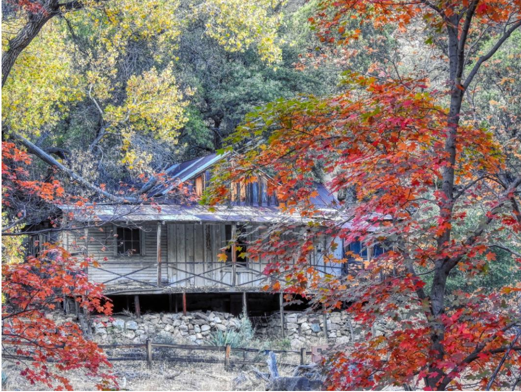
Fall in Ramsey Canyon